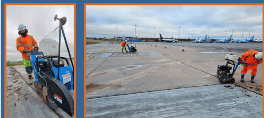
JOINT SEALING AT BIRMINGHAM AIRPORT